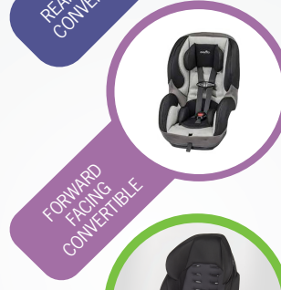
FORWARD FACING CONVERTIBLE

These seats typically fit children between 40 and 100 pounds. This seat can only face toward the front of the vehicle. All children should sit in the seat with a harness until they reach the harness height or weight limit. When used as a harnessed seat, it can be installed using a vehicle seat belt or the LATCH system. Harness straps are removable when child is ready to use booster feature. When used as a booster seat, pull the seat belt over the car seat to restrain the child. When installed in vehicle use top tether anchor. See your car seat manual for more information.