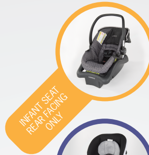
INFANT SEAT REAR-FACING ONLY

These seats typically fit children between 4 and 35 pounds but every car seat is different. Some car seats start at 4 pounds and some start at 5 pounds, and they stop at 22, 30 or 35 pounds. The seats will always face towards the back of the vehicle. When a child has reached the height OR weight limit of this seat, he or she should be moved to a rear facing convertible car seat. You may install this seat using a vehicle seat belt or the lower anchors. See your car seat manual for more information.