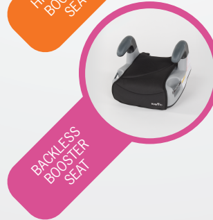
BACKLESS BOOSTER SEAT