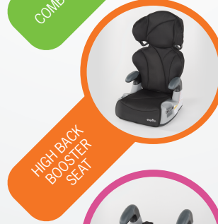
HIGH BACK BOOSTER SEAT